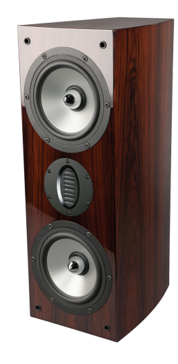
High-gloss South American Rosewood finish.

382 Marshall Way, Ste. A, Layton, Utah, USA 84041